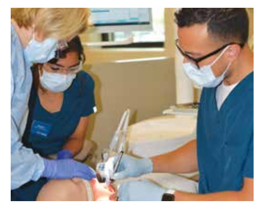
Dental Hygienist class

If you are unable to attend, don't worry! All of our services are available Monday - Friday during the fall semester. Call 269.488.4040 to set up an appointment with an advisor or counselor. If you have financial aid questions, call 269.488.4340.